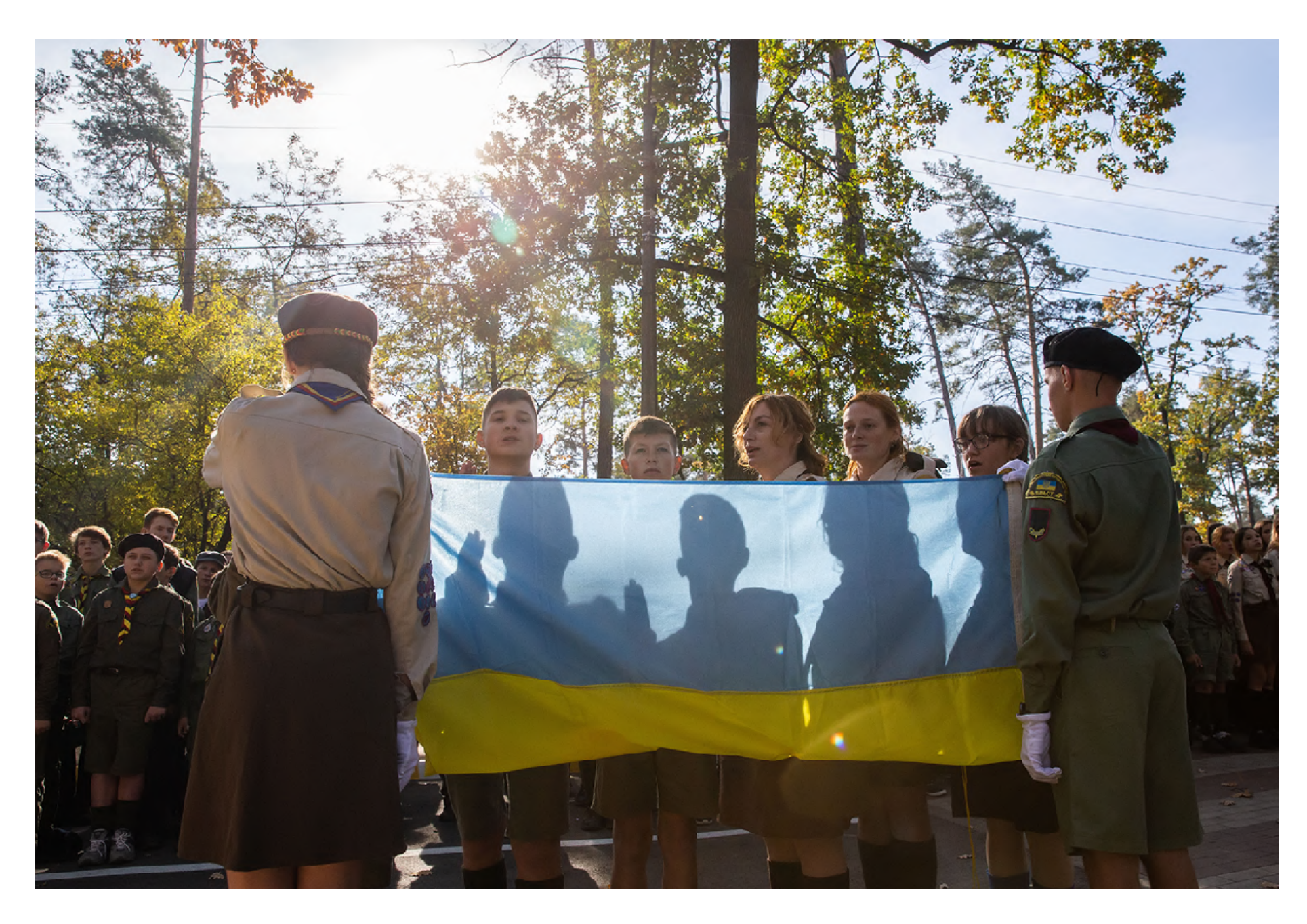
Status of membership in Ukraine